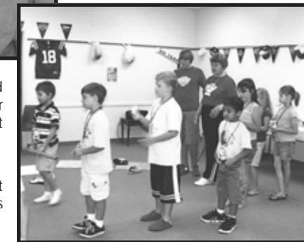
Right: Children enjoy VBS at Colonial Baptist Church this summer.