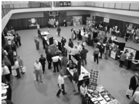
Engage 2009 participants visited more than 50 exhibits displaying ministry opportunities and resources for churches in the Mid-South Baptist Association.