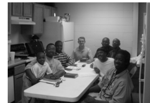
Top: Miracle Baptist Church Sunday Services are held at The Inner-City Outreach Center.