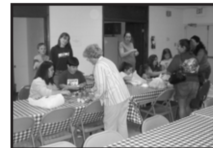
Children at Fellowship Baptist Church inspect their finds at the church Easter egg hunt this past spring.