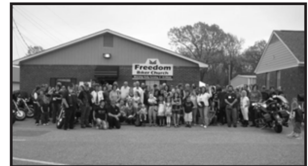
Freedom Biker Church Mississippi held their first worship rally on Easter Sunday morning with 167 people in attendance.