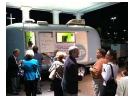
Representatives to ENGAGE 2011 enjoy the "fellowship of frozen yogurt" provided by Baptist Campus Ministries of Memphis and YoLo Frozen Yogurt .