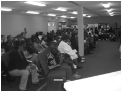
Members of Hope Fellowship Baptist Church meet at the Bent Tree Apartment Complex.