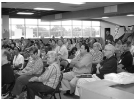
A full classroom of participants listen closely during one of the sessions.