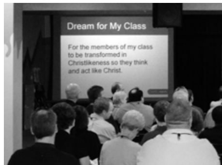
Participants learn how their classes can be transformed to Christlikeness.