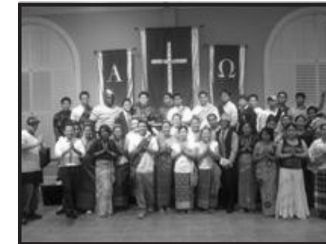
Members of First Laotian Baptist Church recently held a Cultural Fest.