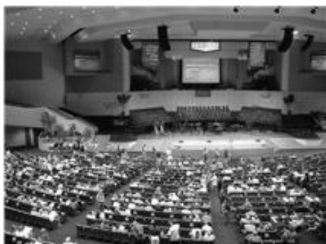
Friday Night Opening Session at Bellevue Baptist Church, Cordova with close to 1200 in attendance.