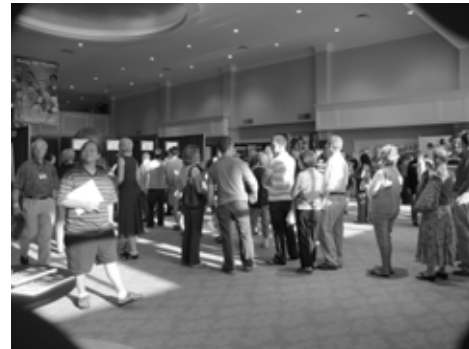
Some of the participants register before the sessions begin.